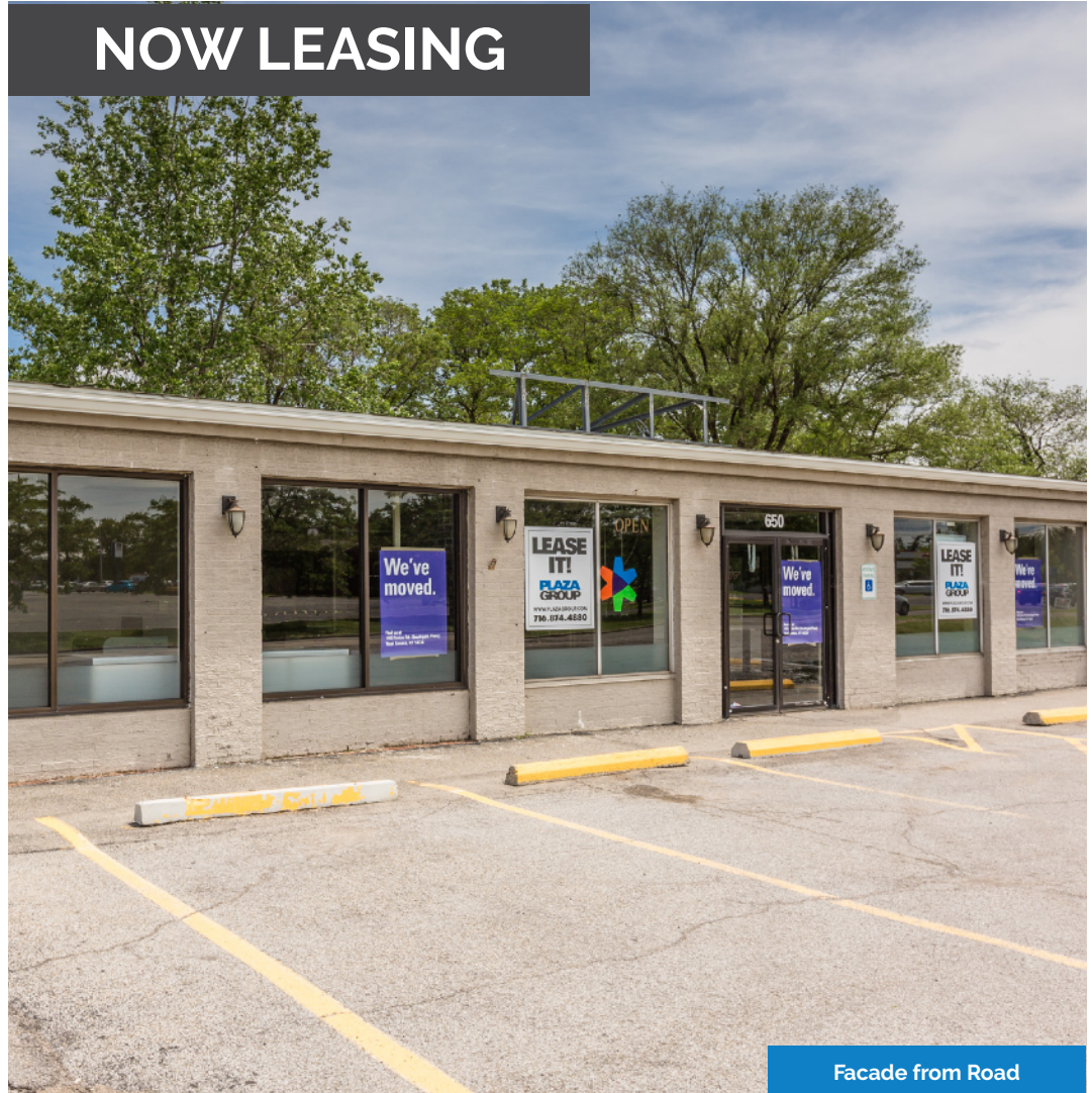
Facade from Road