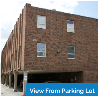
View From Parking Lot