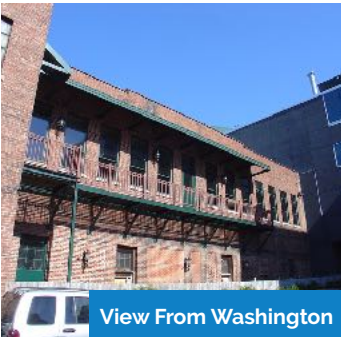
View From Washington