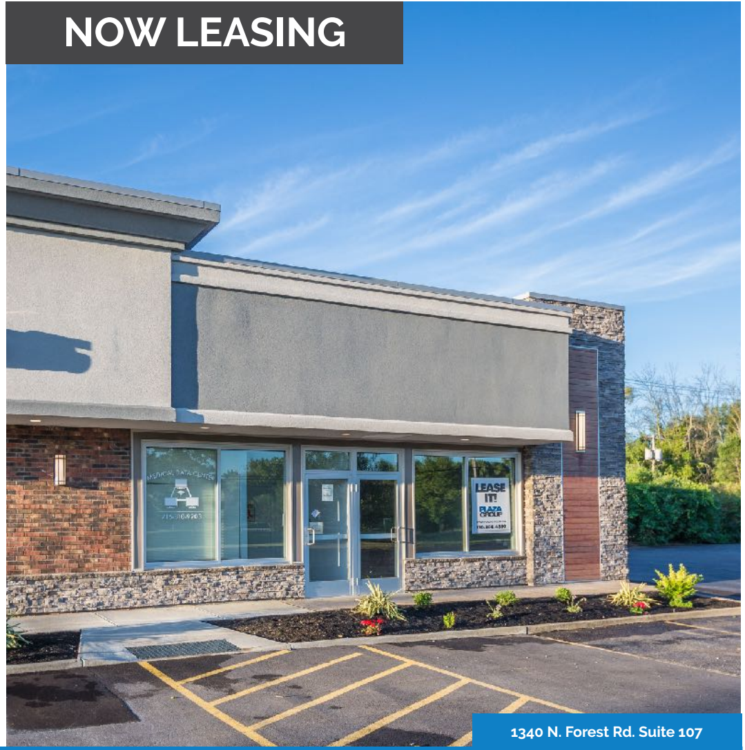
1340 N. Forest Rd. Suite 107